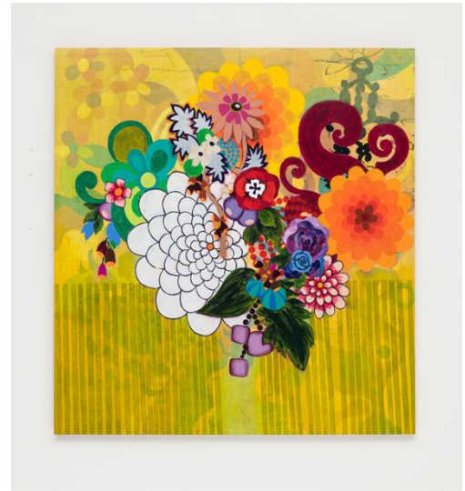
Beatriz Milhazes, Os Campeões , 2001 © Beatriz Milhazes, courtesy Pace Gallery

Pace Gallery is pleased to present a group exhibition bringing together leading figures from the gallery's program of modern and contemporary artists as a means of introducing Pace to the community of East Hampton. On view July 22–29, 2020 at the gallery's temporary space at 68 Park Place in East Hampton village, this exhibition includes 15 artists from Pace's roster alongside others from their orbit—spanning seminal artists who have shaped the past century of art to some of today's most innovative voices.